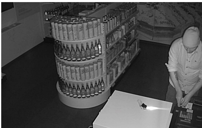
As light diminishes below a certain level, the cameras can automatically switch to night mode to deliver quality images in dark environments.

AXIS M11-L Series provides day and night varifocal multi-in lens and adjustable IR LED illumination for optimal light in selected viewing angles. With Axis OptimizedIR, a power-efficient LED technology that provides an adaptable angle of IR illumination and discreet integration of IR LEDs, the cameras provide automatic illumination of a scene in complete darkness, at an event or when requested by a user. The IR LED illumination which is invisible to the human eye, is perfect for discovering objects in a range of up to 15 meters (50 ft)